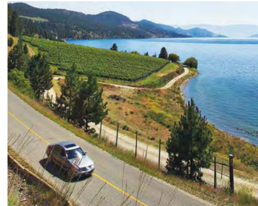
➤ The S400 HYBRID glides silently through fruit country, high above Lake Okanagan.