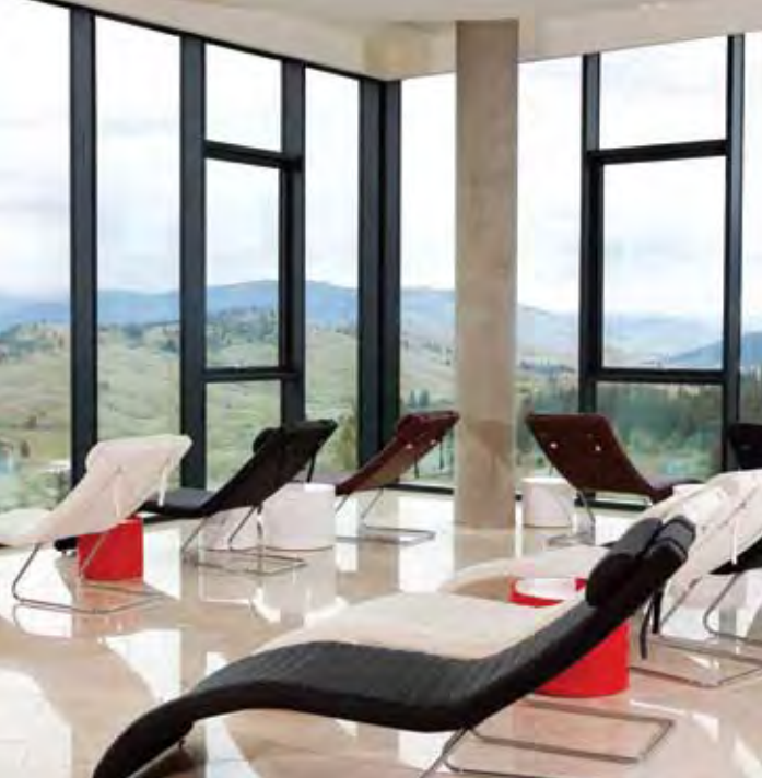
➤ (Above) Sparkling Hill's "Serenity Room" and (right) Swarovski-crystal-draped entrance.