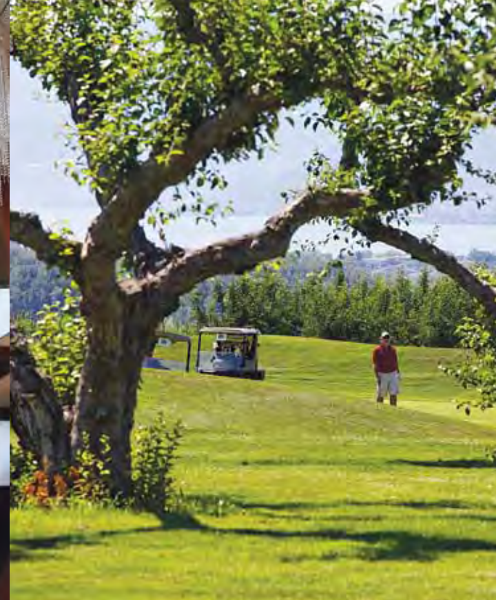
➤ The Harvest Golf Club is both a championship-length course and a working orchard.