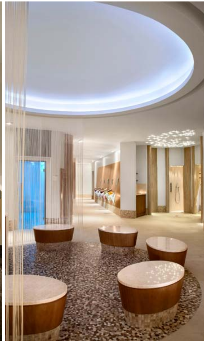
This and opposite page, from left: PeakFine's crystal chandelier; the Penthouse Suite's bathroom; and the spa's steam and sauna area.

Ultimately, $10 million worth of Swarovski crystal elements, including two million loose ones as well as luminaires and lighting systems, were used. One of the most captivating installations is the crystal "waterfall" cascading down from the ceiling in the lofty lobby. In the spa, a vertical curved curtain of sparklers greets guests at the entry, signage shimmers a different color for each area, and lighting in all treatment rooms dons the namesake as well. And light-reflecting crystal elements are found throughout the 152 guestrooms and three penthouses—in the cabinetry, the "Starry Sky" ceiling over the bath, and a large cluster in the fireplace that flickers with red light thanks to color-changing LEDs.