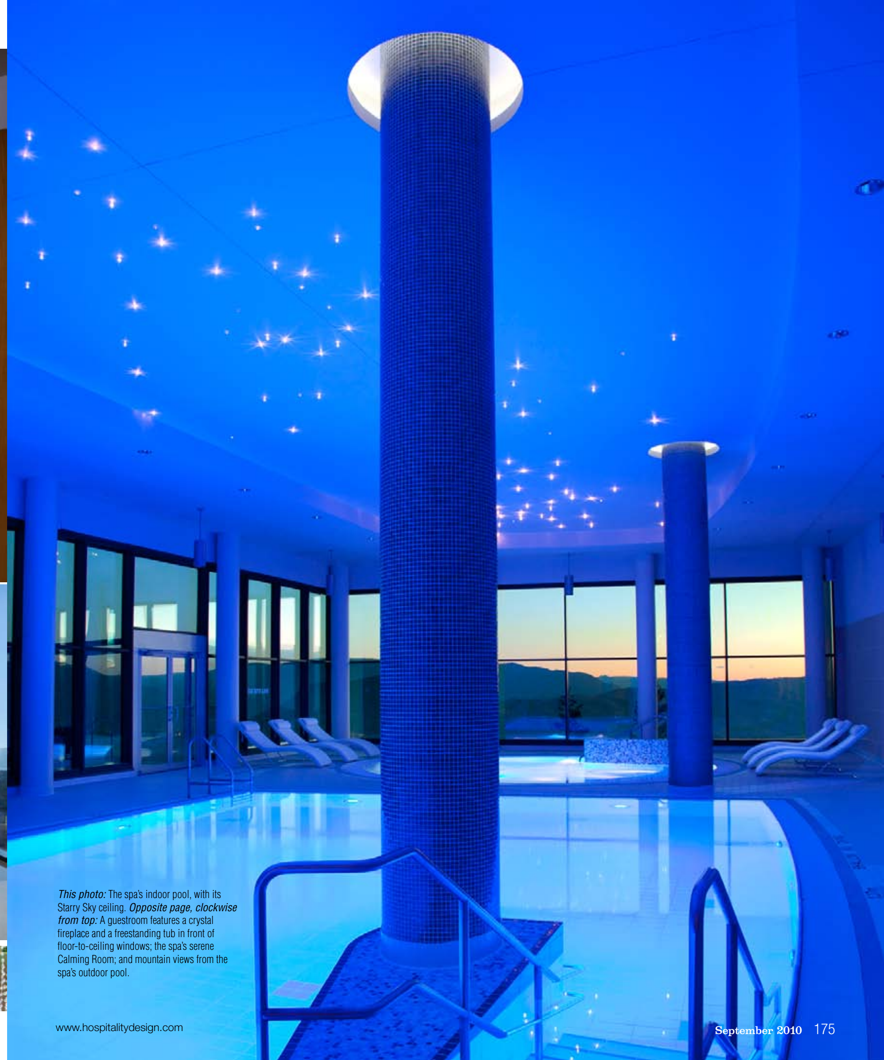
This photo: The spa's indoor pool, with its Starry Sky ceiling. Opposite page, clockwise from top: A guestroom features a crystal fireplace and a freestanding tub in front of floor-to-ceiling windows; the spa's serene Calming Room; and mountain views from the spa's outdoor pool.