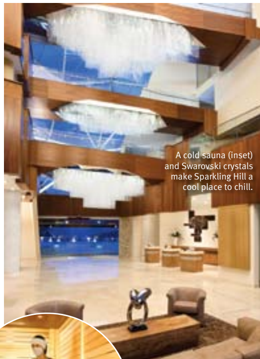
A cold sauna (inset) and Swarovski crystals make Sparkling Hill a cool place to chill.

3. At Silverwood Theme Park's Boulder Beach water park near Coeur d'Alene, Idaho, the new Ricochet Rapids ride finally answers the question of what it's like to float down a 737-foot-long tube on a 4- to 6-person raft. (208) 683-3400, www.silverwoodthemepark.com . —ROB BHATT/LESLIE FORSBERG