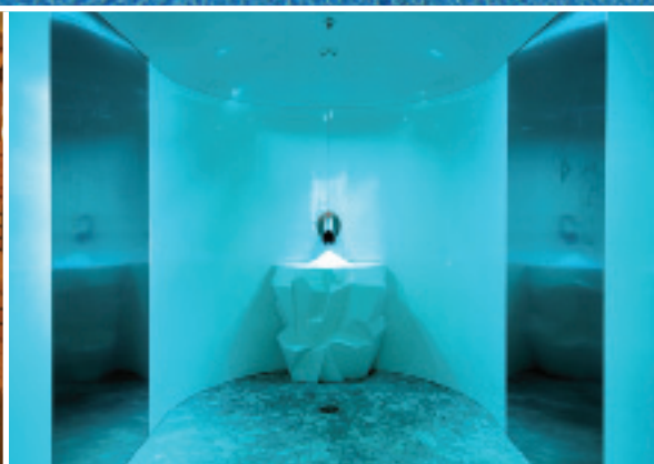
Cryotherapy cold sauna